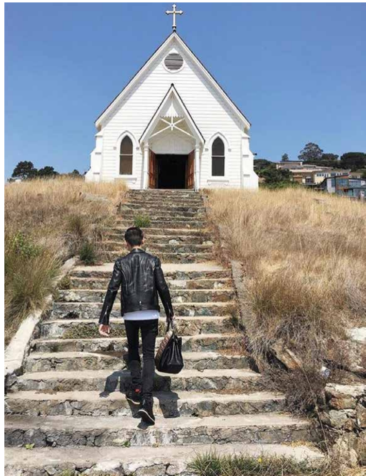
Old St. Hilary’s in Tiburon, California.

The first thing he did was to find the place. Old Saint Hilary’s was a small, white church on a hill overlooking San Francisco. It just didn’t hold Catholic services anymore because the parish had moved to a different location. He booked it immediately. Now that he had found his church, he needed to find someone to marry him, and he wanted that